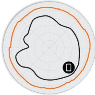
Figure 3. R750 5GHz AzimuthAntenna Patterns