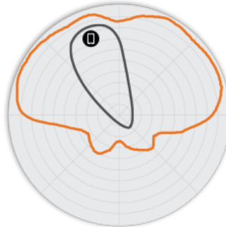
Figure 4. R750 2.4GHz Elevation Antenna Patterns